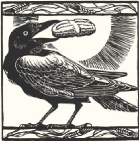
RIESLING WINE from WASHINGTON STATE